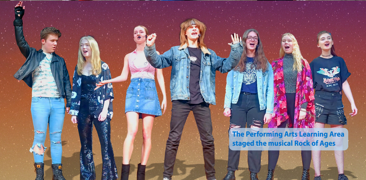
The Performing Arts Learning Area staged the musical Rock of Ages